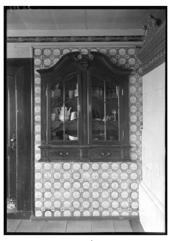
The interior of the defunct home Classen in Palczewo (Żuławy) with Dutch tiles, approx. 1938.

Blue "delfts" arriving in huge quantities in the holds of ships to Dutch the ports of Gdańsk and Elbląg, where he still stumbles upon them in the course of excavations archaeological sites. Dutch ornamentation also had a huge impact on the local ceramics: Gdańsk, Elbląg and Żuławy. Yet another phenomenon was Dutch tiles - wall tiles decorated ships